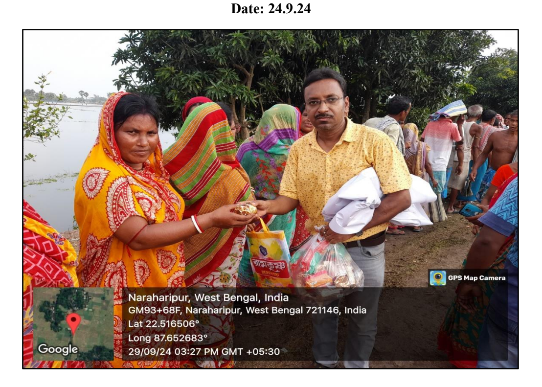
Reaching Out to the victims of flood affected area in Purba Midnapore

The practice faces challenges like inconsistent donations and limited awareness among some stakeholders. Resources needed include more effective communication strategies, volunteer coordination, and logistical support for collection and distribution.