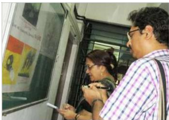
Judges at the poster competition