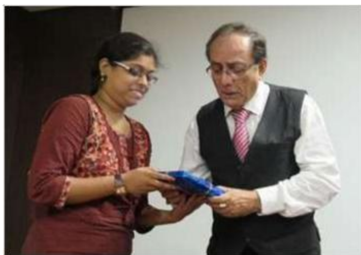
Prize-giving at the poster competition