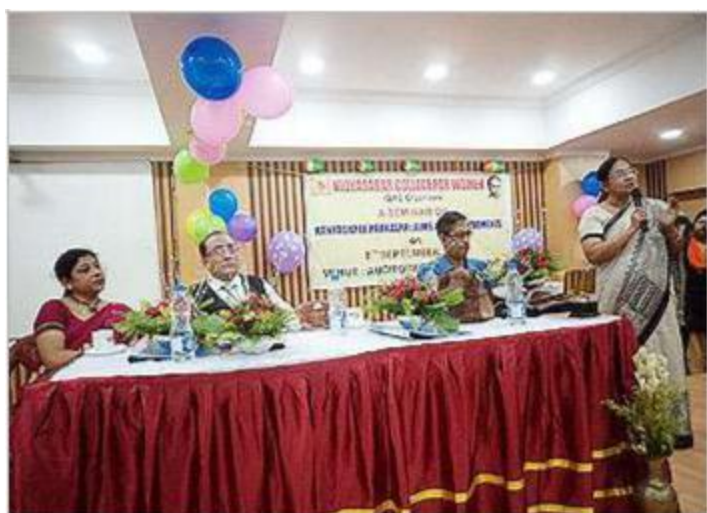
Principal's address at the Seminar