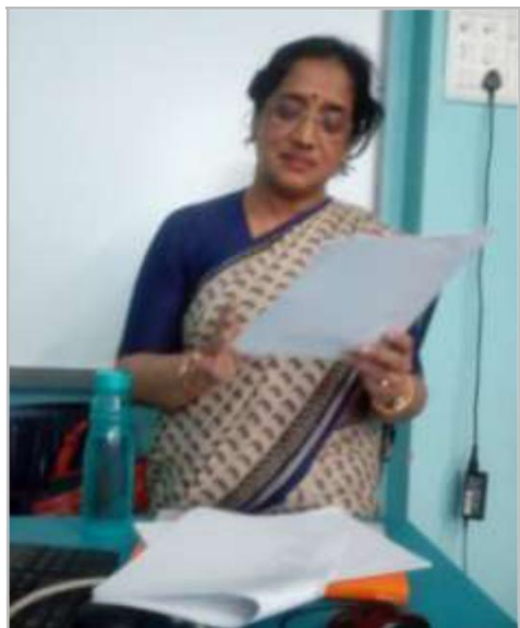
Powerpoint presentation by IQAC Convener on Preparation for NAAC Re-accreditation on 20.9.2016