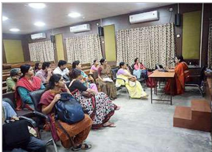
Teachers at the Seminar