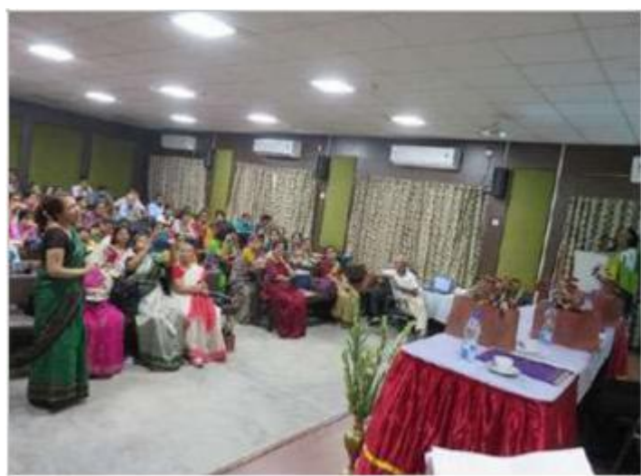
Audience at the Seminar