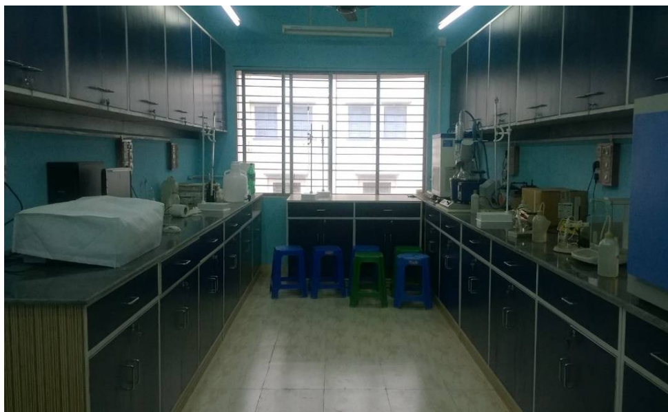
Chemistry lab in new building

The AC Auditorium of the college has been equipped with ICT facilities.