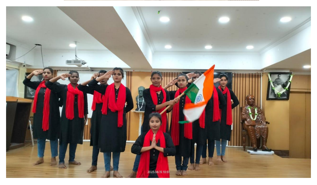
Some glimpses of the performance of the drama MATDAN in College Auditorium