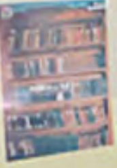
A library established by him