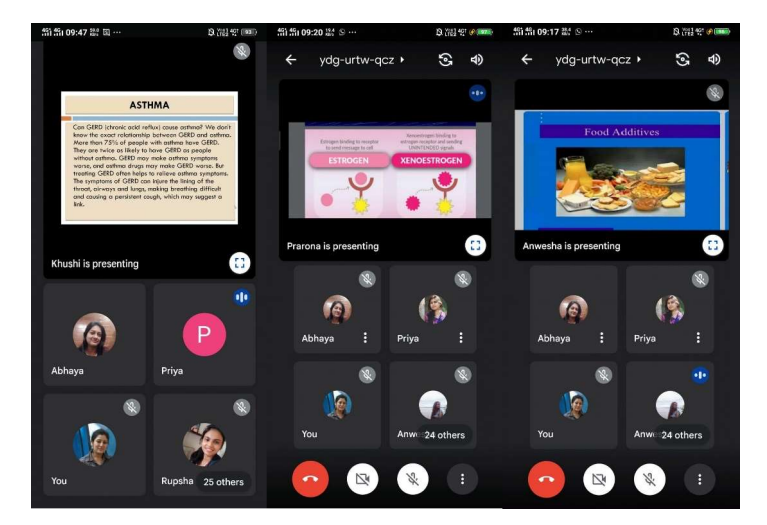
Principal Vidyasagar College For Women Kolkata-700 006