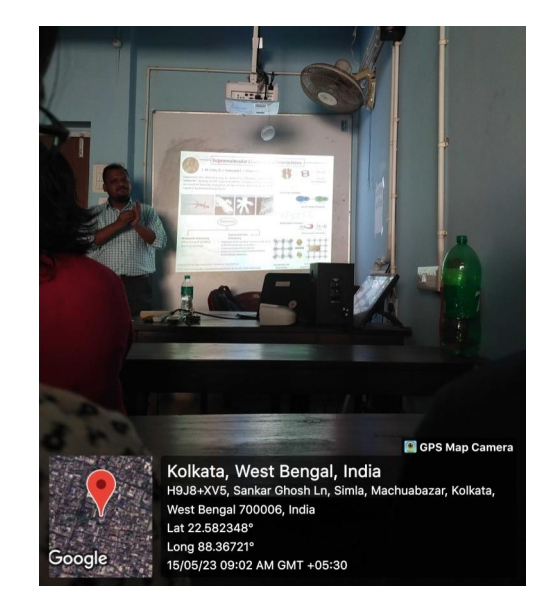
Principal Vidyasagar College For Women Kolkata-700 006